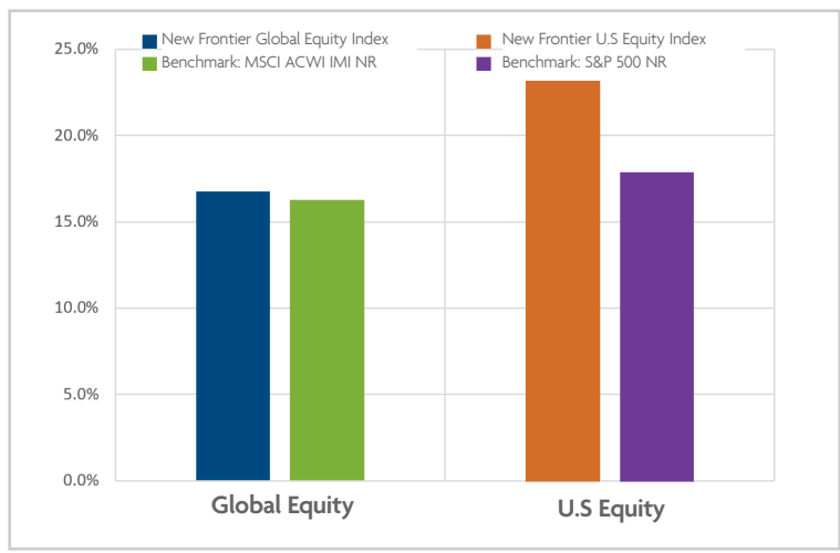
Global and U.S. Equity Index Performance: 2020

More information is available at newfrontieradvisors.com